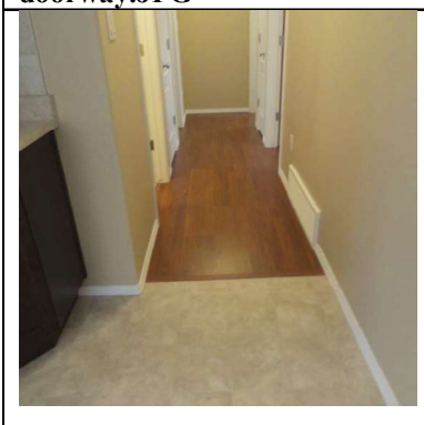
12/12/2014 main floor hallway DSC03803 site 809 main floor hallway.JPG