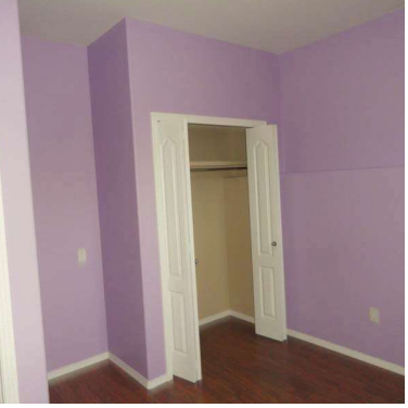
12/12/2014 basement bedroom closet and doorway DSC03799 site 809 basement bedroom closet and doorway.JPG