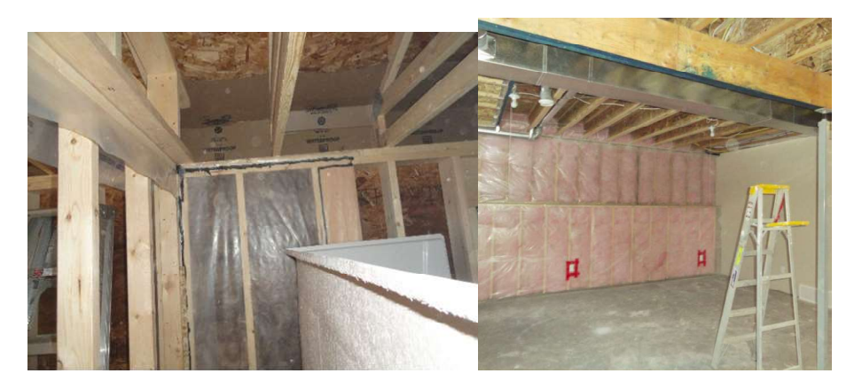
Installation of insulation and vapour barrier