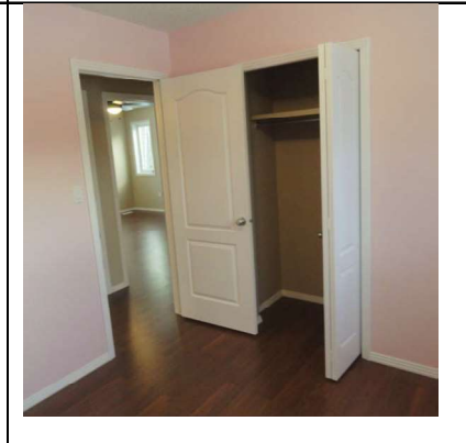
12/12/2014 Front centre bedroom 2 DSC03806 site 809 Front centre bedroom 2.JPG