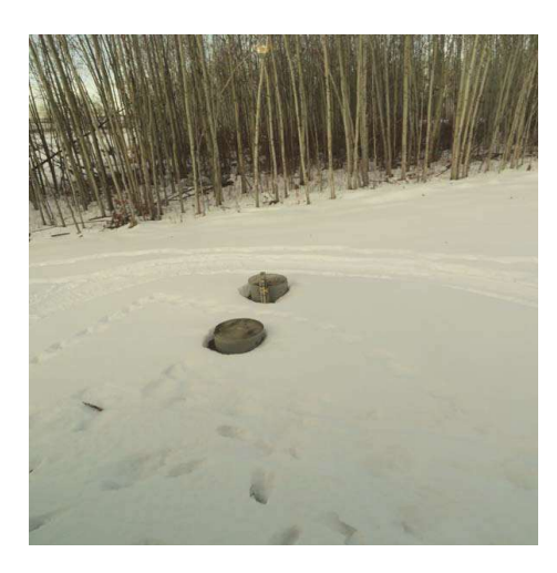
12/12/2014 Sewer tanks DSC03823 site 809 Sewer tanks.JPG