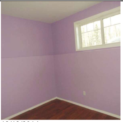
12/12/2014 basement bedroom from doorway DSC03798 site 809 basement bedroom from doorway.JPG