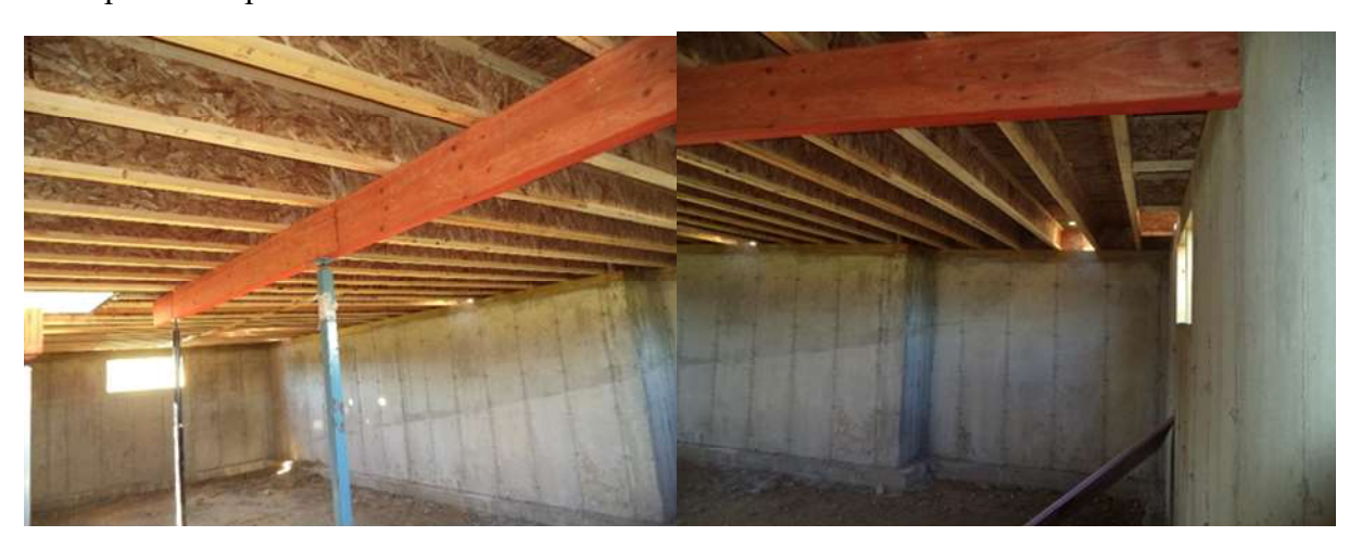
Example of 3.3 picture