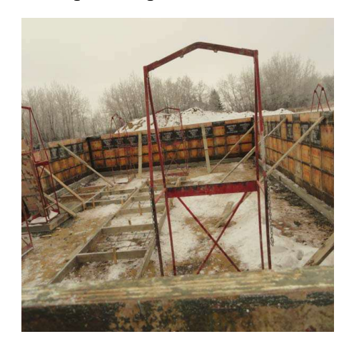
Pad size and depth