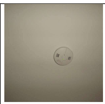
12/12/2014 Basement CO smoke alarm DSC03797 site 809 Basement CO Smoke alarm.JPG