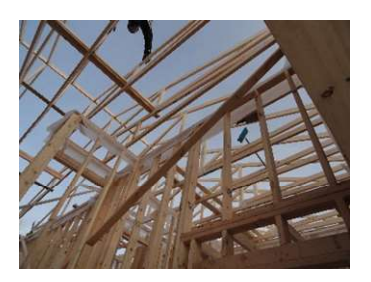
Spacing of framing members