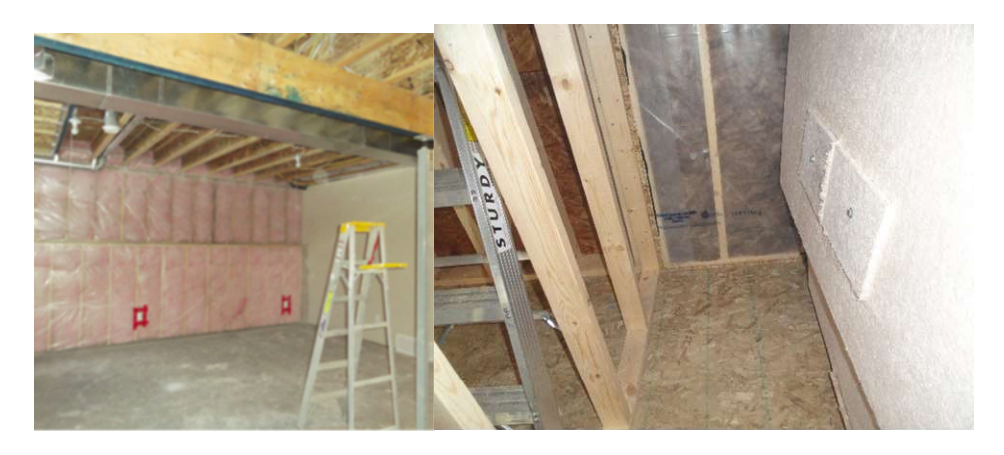
Example of 4.3 pictures