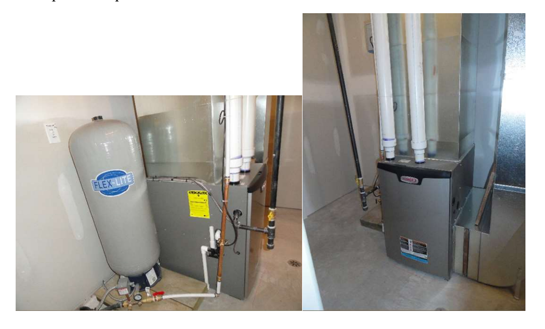
Example of 5.2 picture