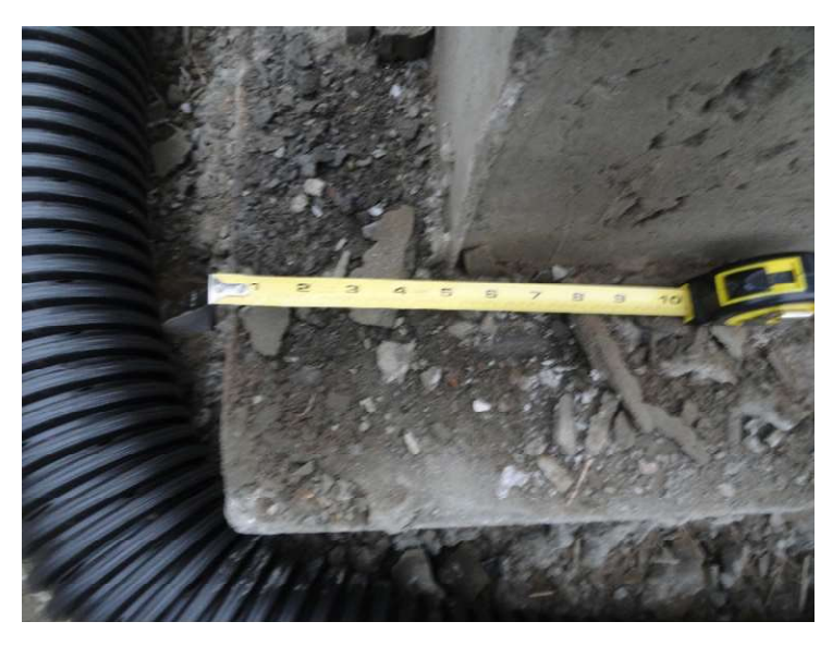
Footings projection SE corner